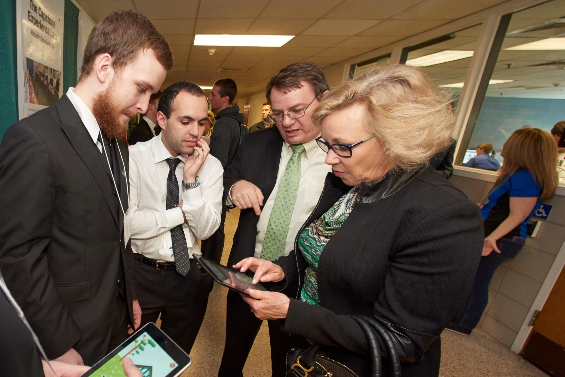
MSU Board of Trustees Member