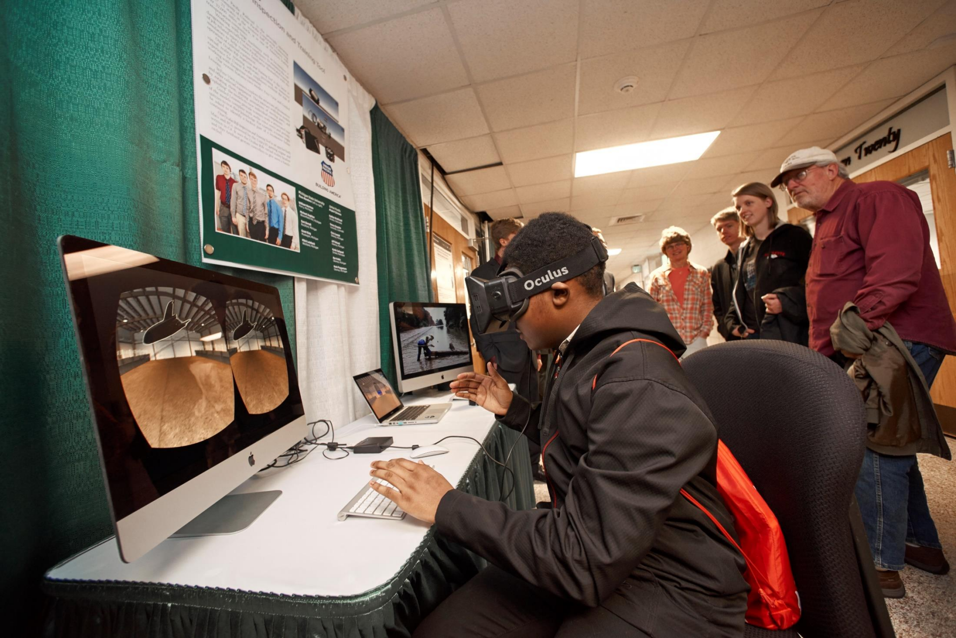
Middle and High School Students