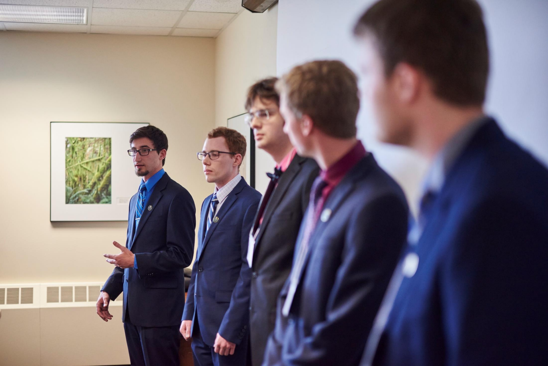
Presenting to Judges