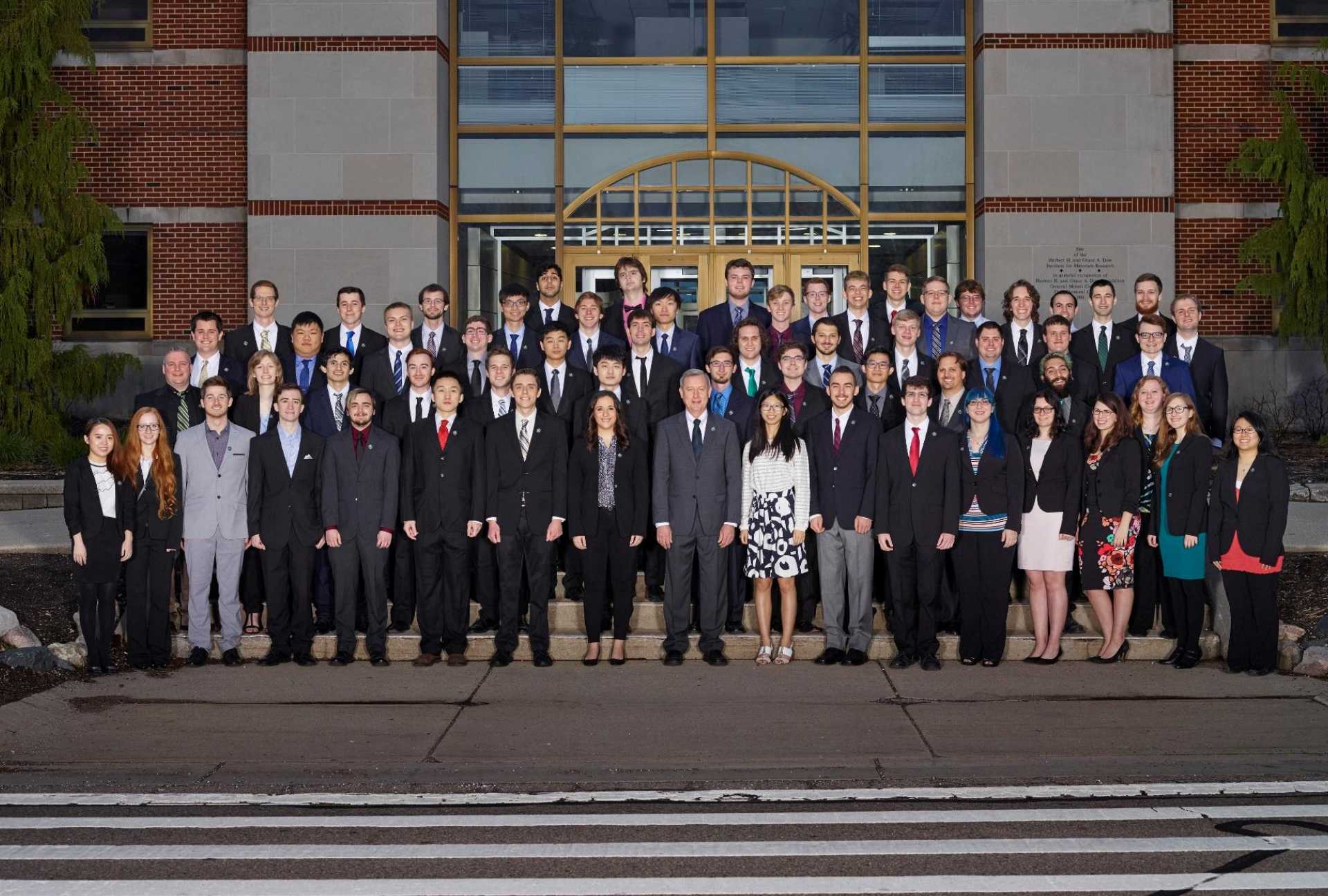
CSE Students Ready to Go at 7:00am