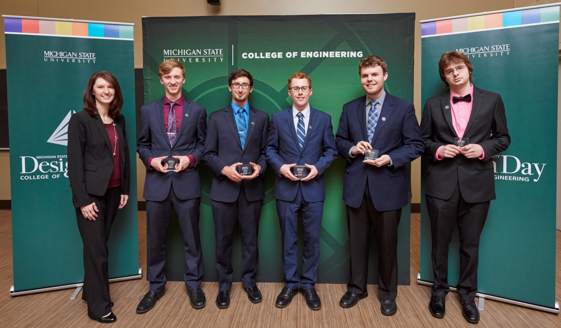
Team Union Pacific Wins Urban Science Sigma Award