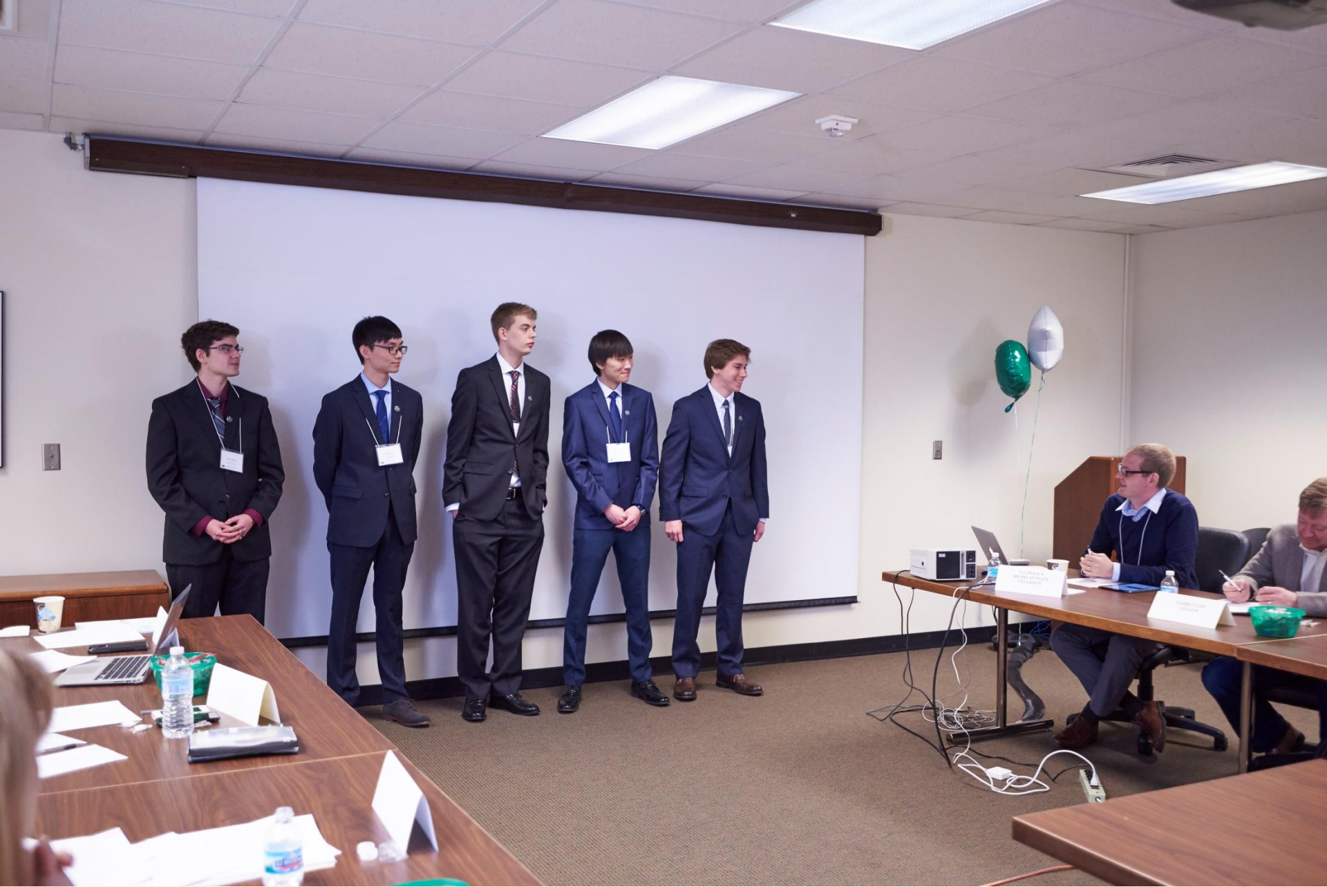
Presenting to Judges