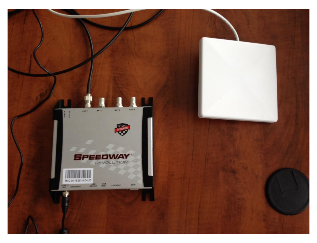
Figure 4: The Speedway Revolution reader with antenna

The RFID reader must be able to take a snapshot of the mobile device inventory. The reader is equipped with an antenna which will monitor the Mobile Device cabinet. The antenna, shown on the right in figure 4, must be placed such that all devices in the cabinet can be scanned by the reader.