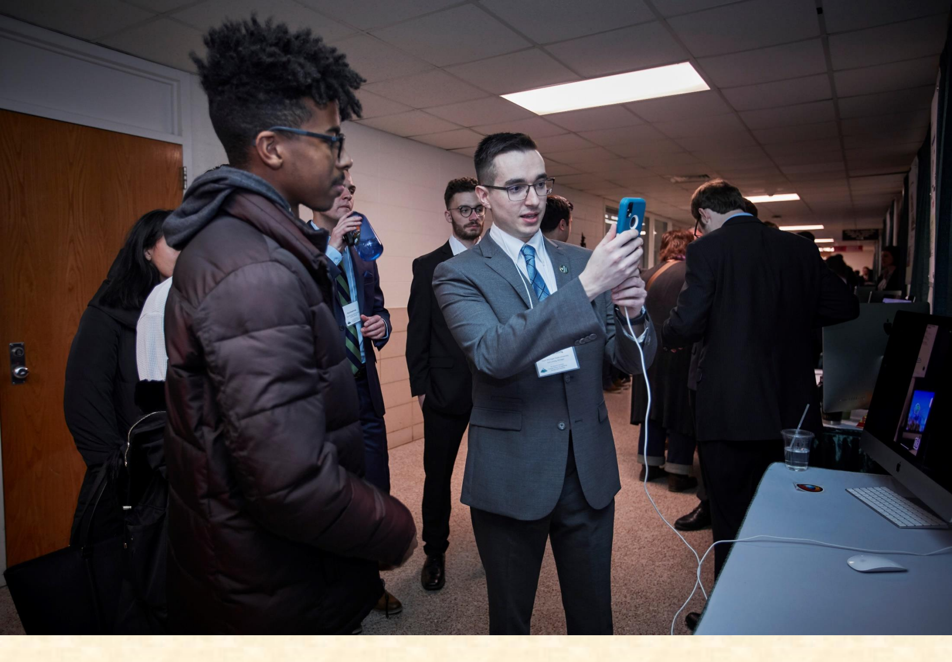
Middle and High School Students