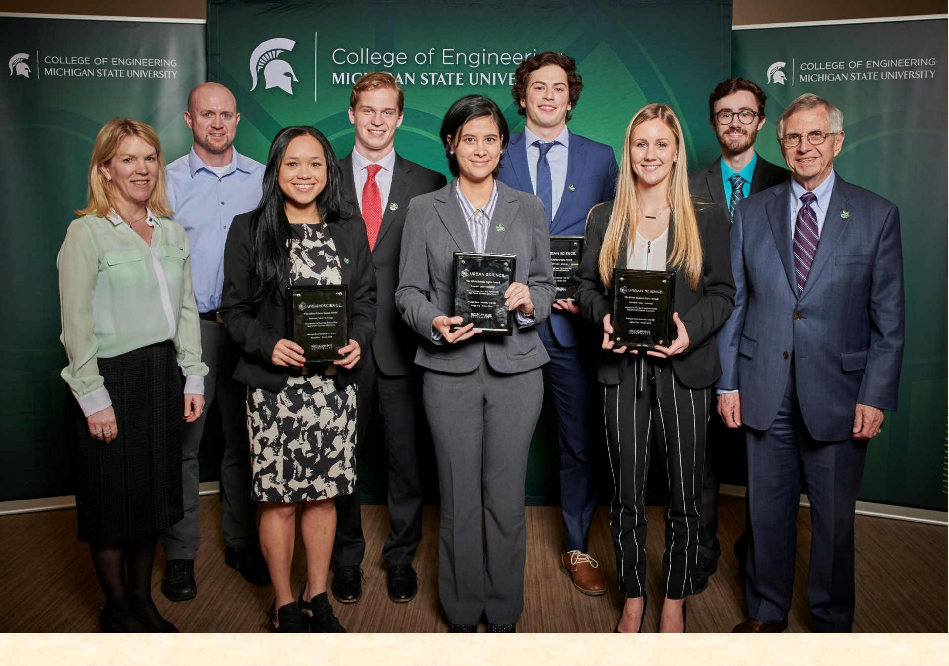
Team MSU ITS Wins Urban Science Sigma Award