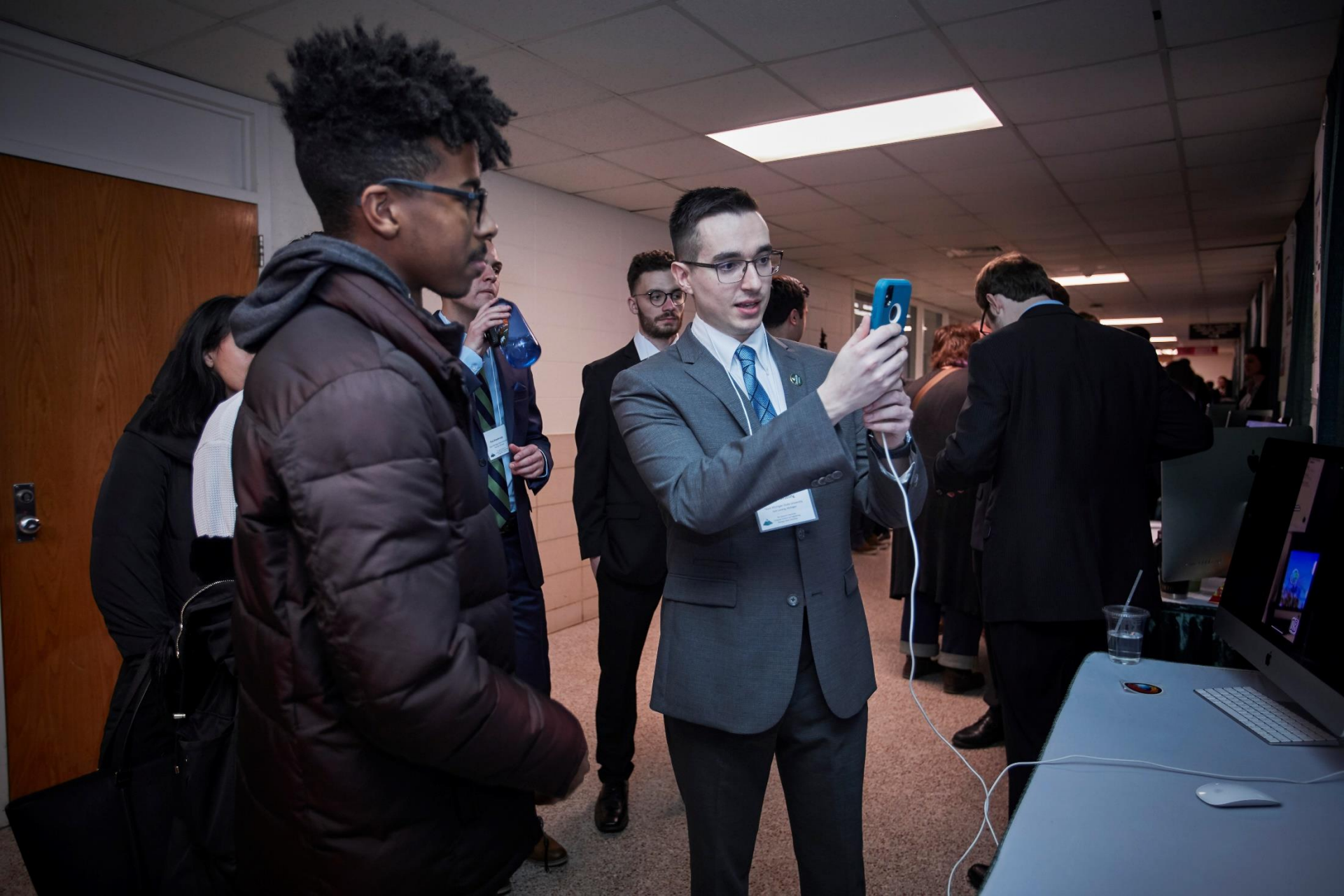
Middle and High School Students