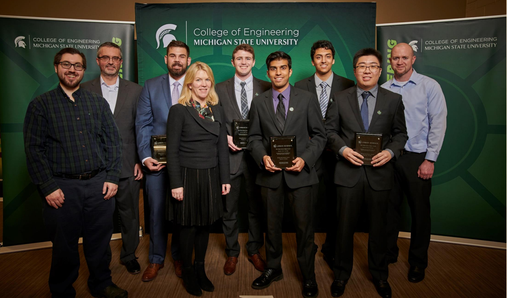
Team Herman Miller Wins Urban Science Sigma Award