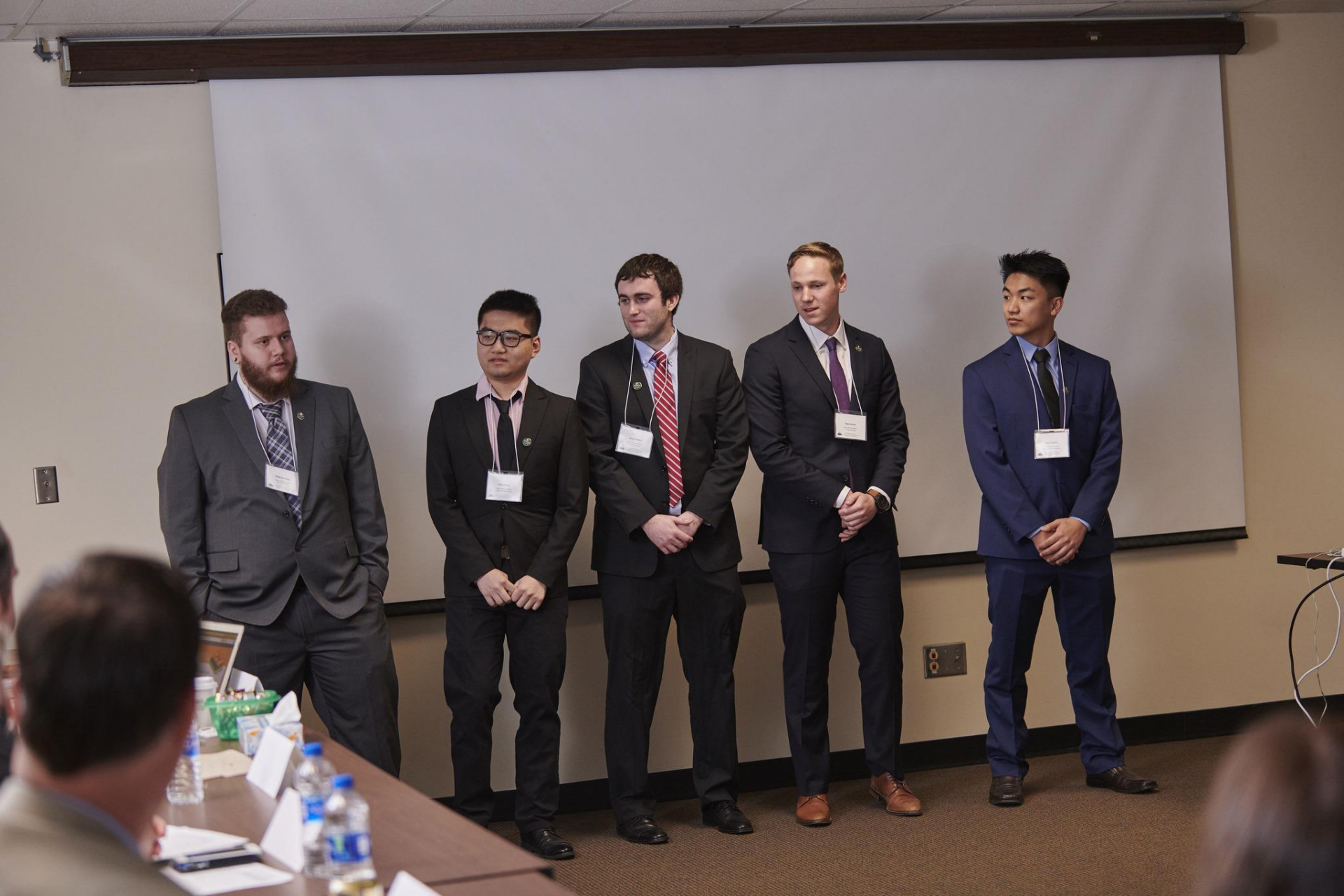
Presenting to Judges