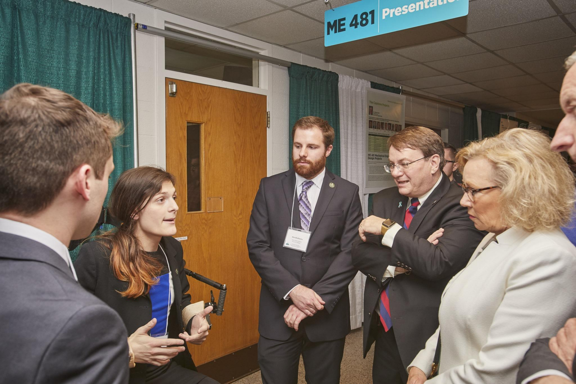
CoE Dean and MSU Board of Trustees Member