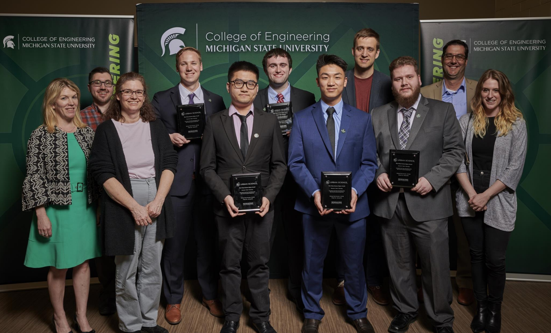
Team Herman Miller Wins Urban Science Sigma Award