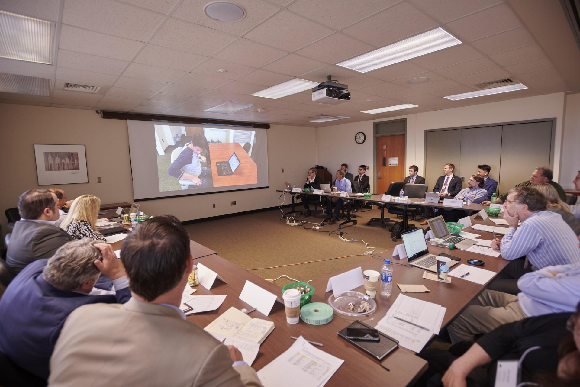
Presenting to Judges