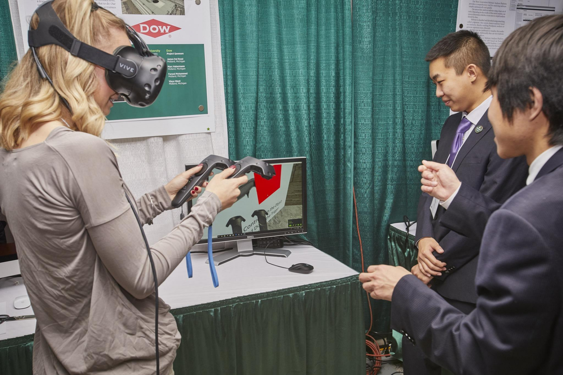
Middle and High School Students