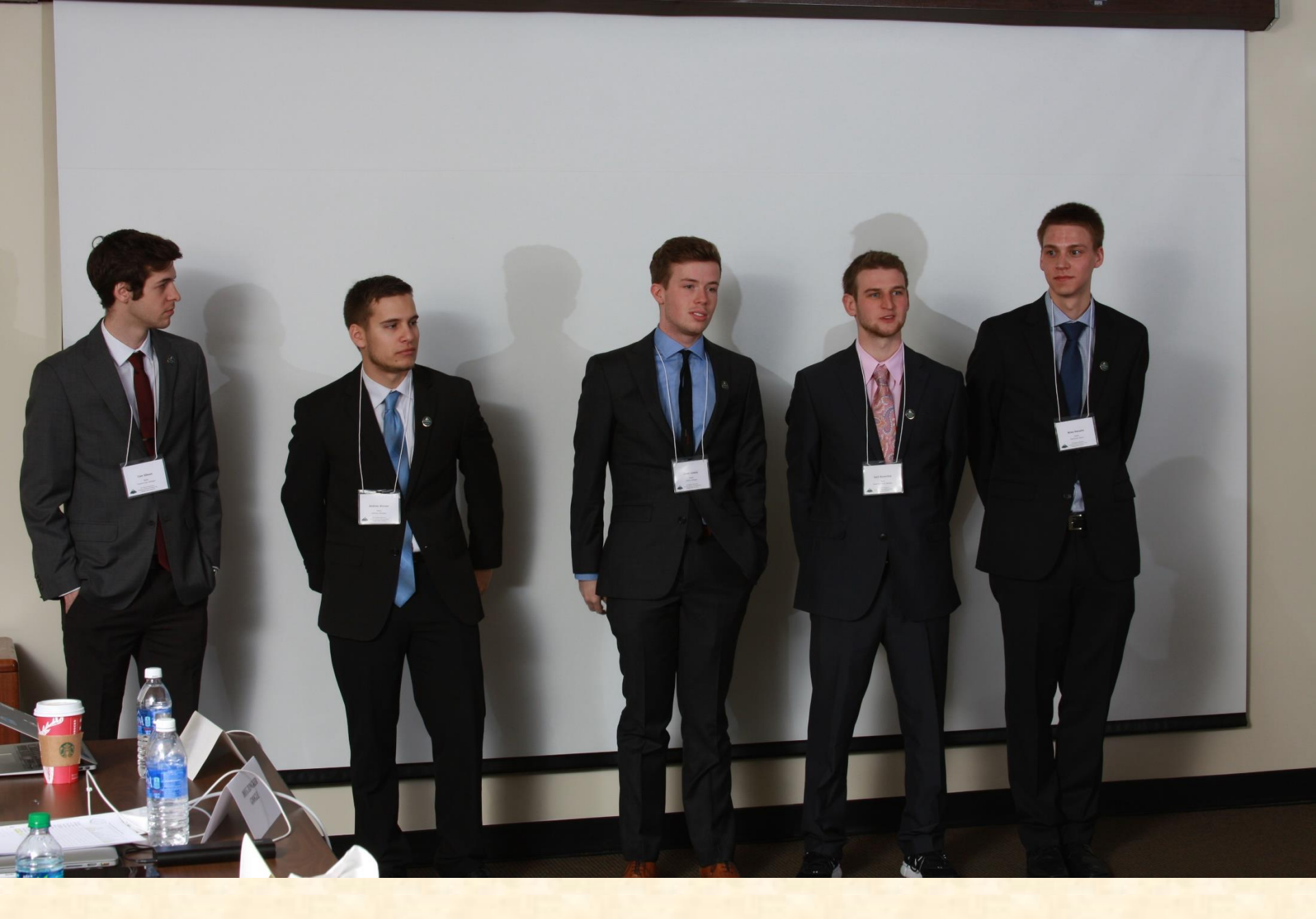
Presenting to Judges