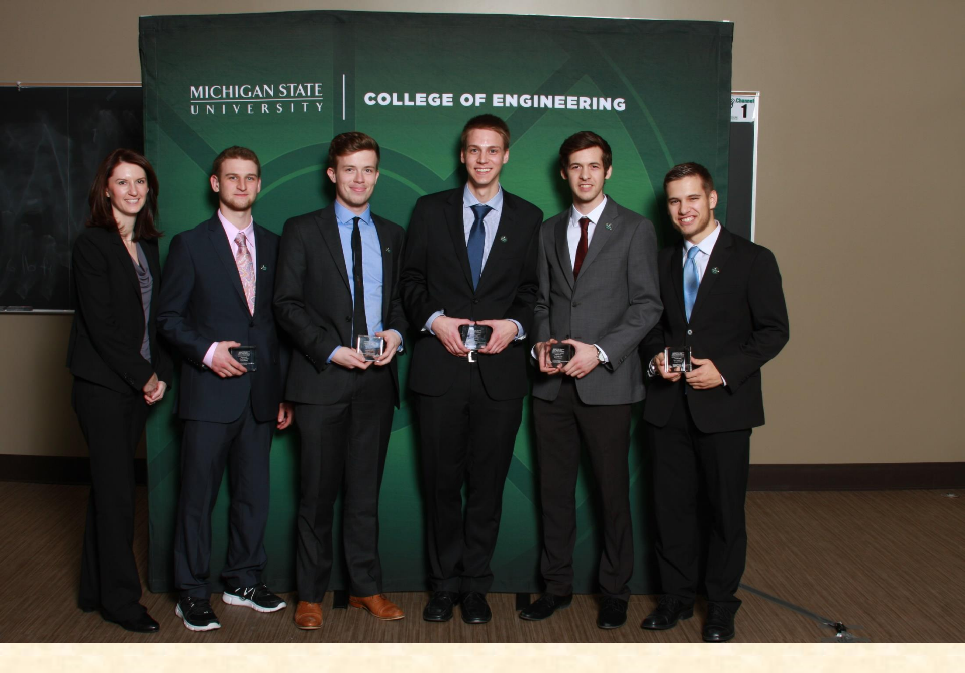
Team Rook Wins MSUFCU Praxis Award