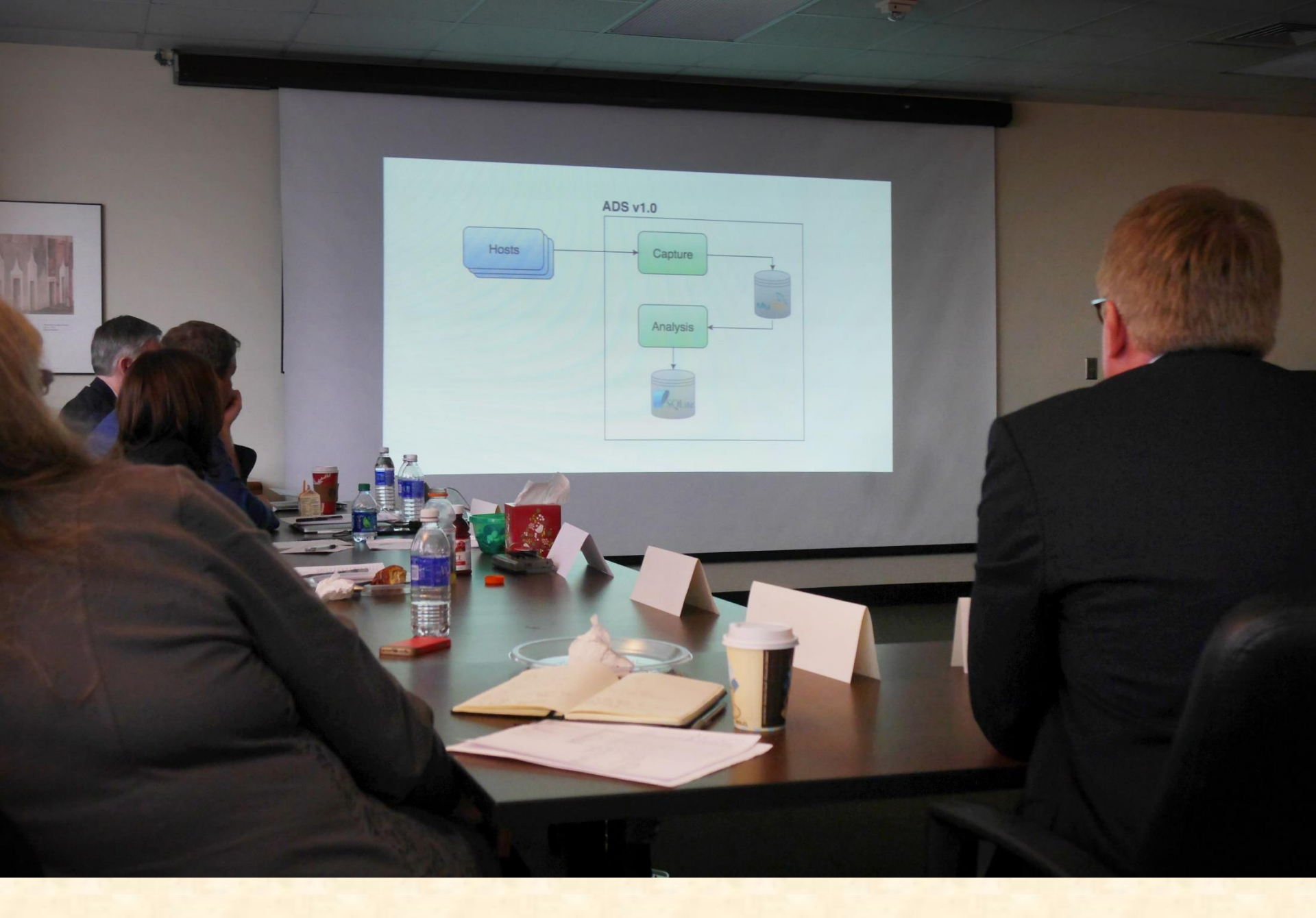
Presenting to Judges