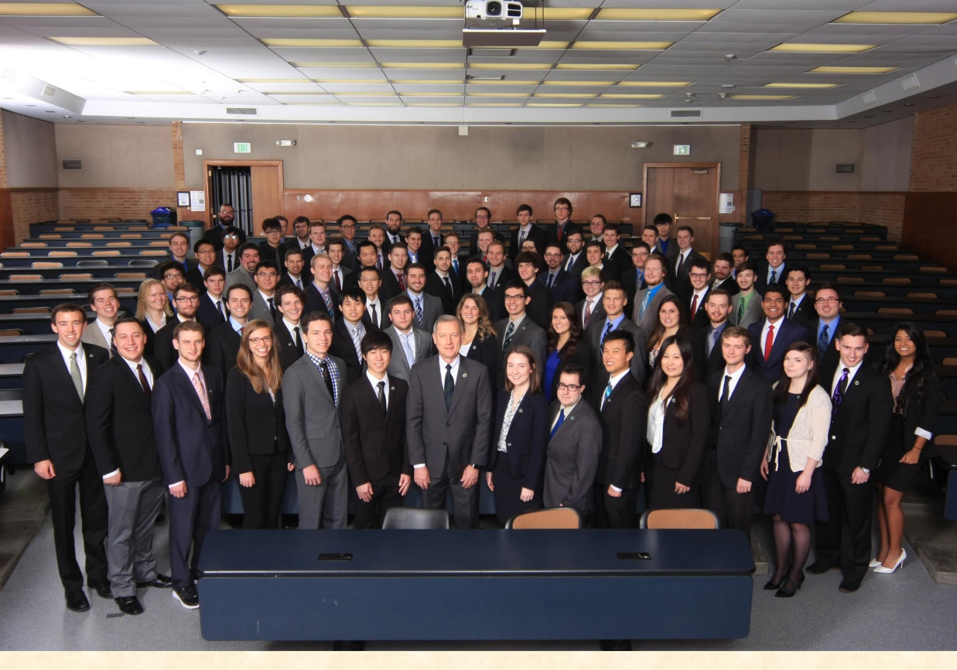
CSE Students Ready to Go at 7:00am