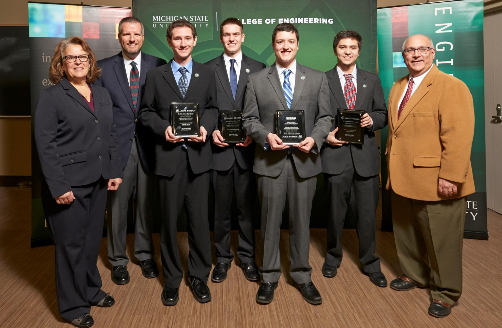
Team Meijer Wins Urban Science Sigma Award