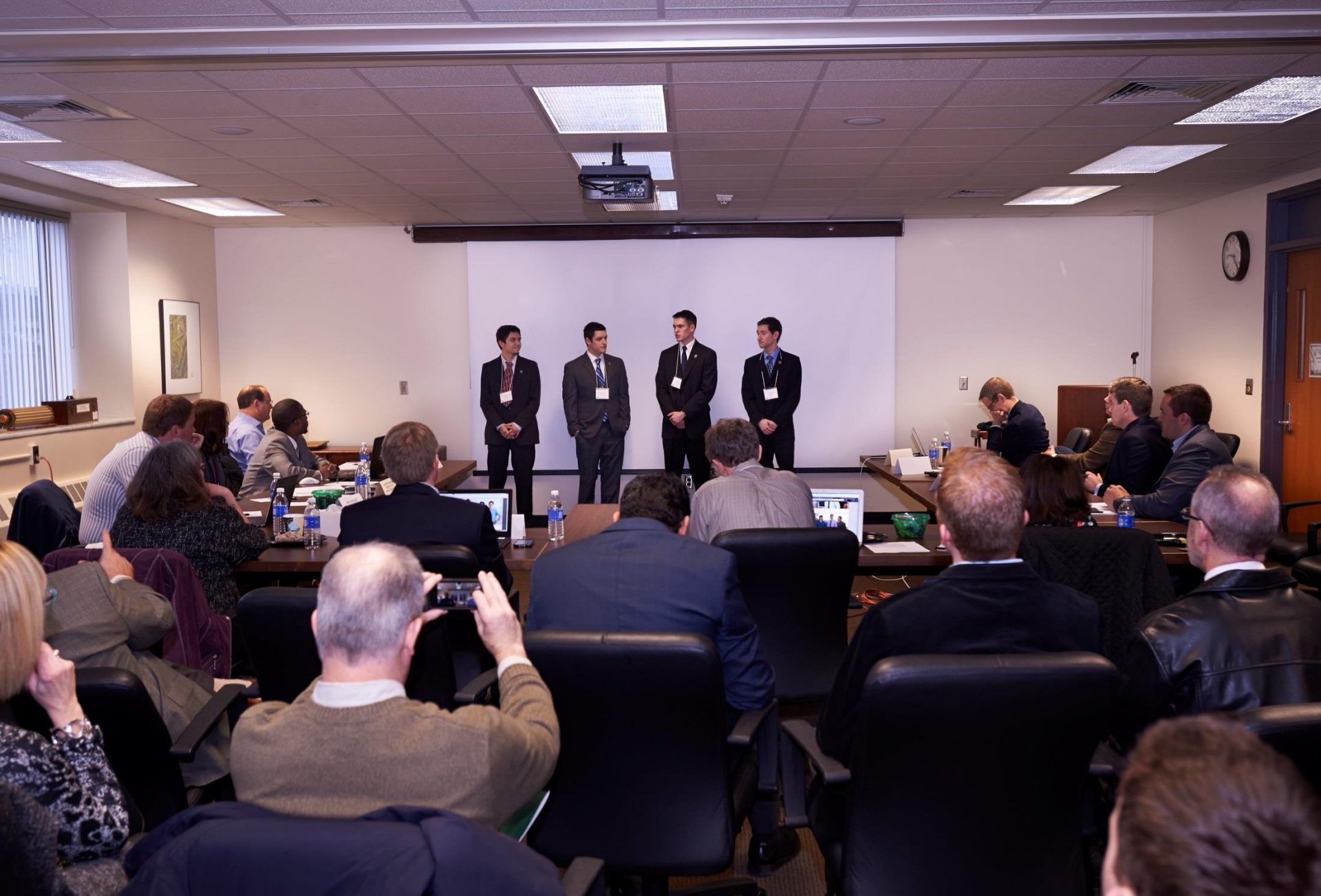
Presenting to Judges