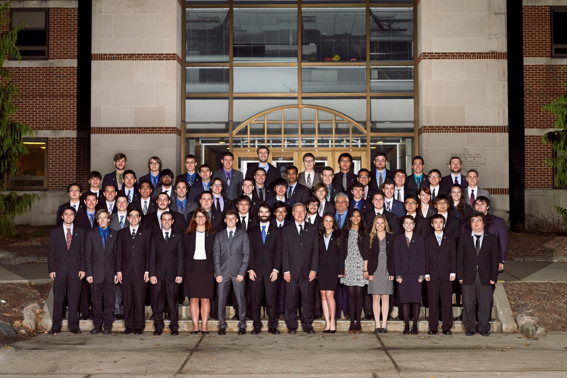
CSE Students Ready to Go at 7:00am